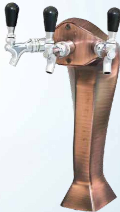
GOTHIC 3 COPPER