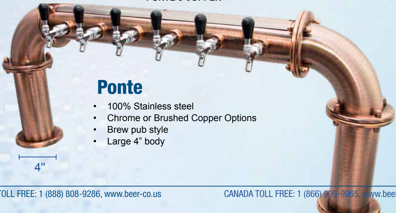
PONTE 6 COPPER