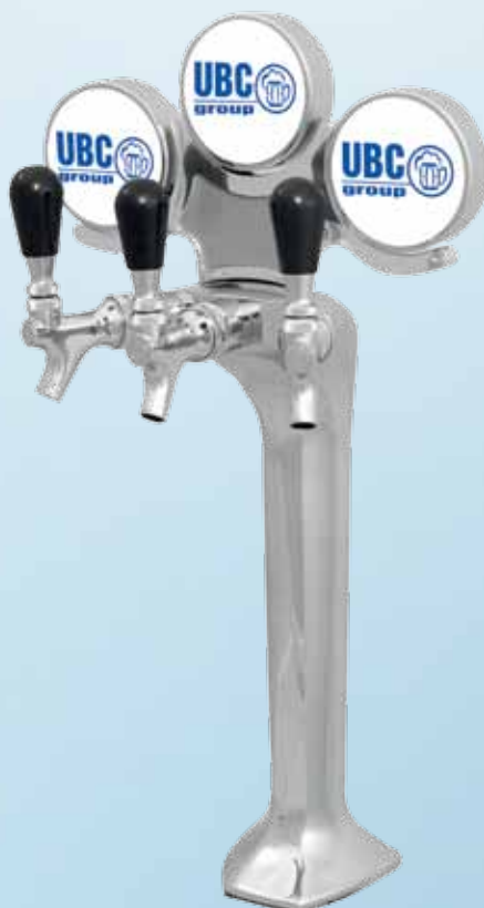
MILANO 3 LED