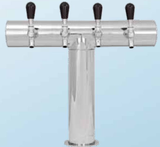
TERRA 4 NF