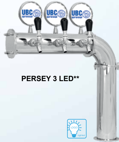
PERSEY 3 LED**