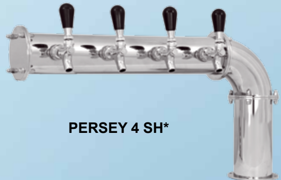
PERSEY 4 SH*

*Short legs are available on any UBC tower