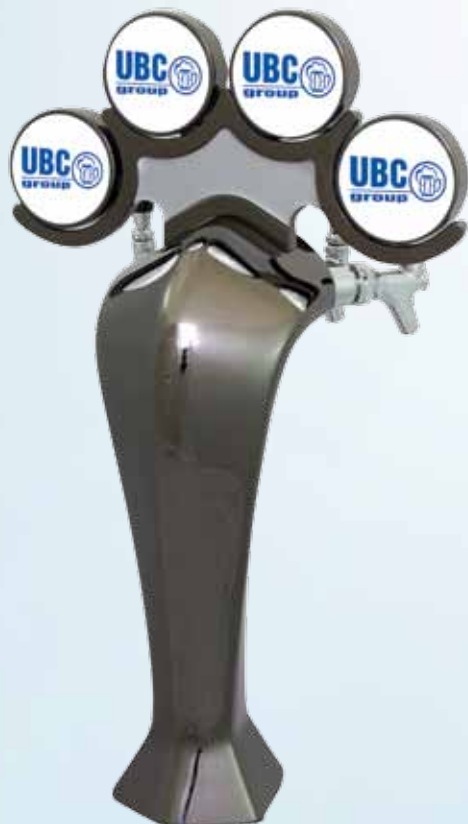
GOTHIC 4 BLACK LED